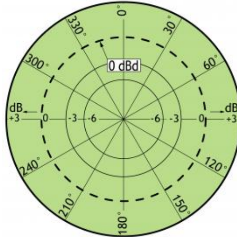
TYPICAL RADIATION PATTERN (H-PLANE)